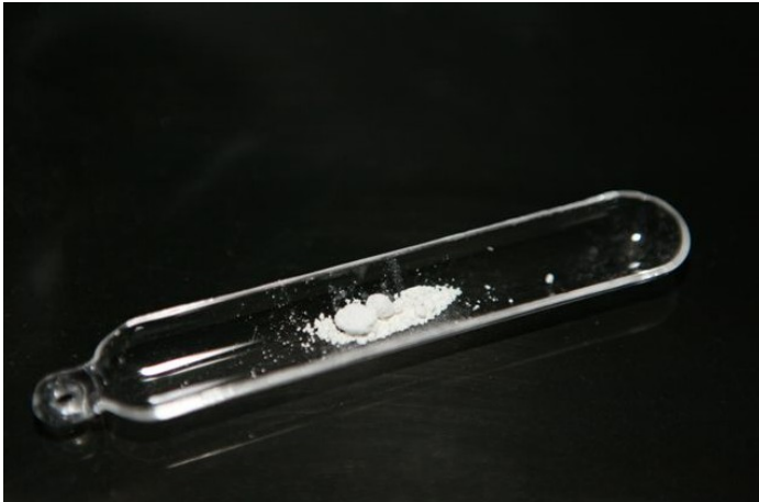
Appearance at visible light